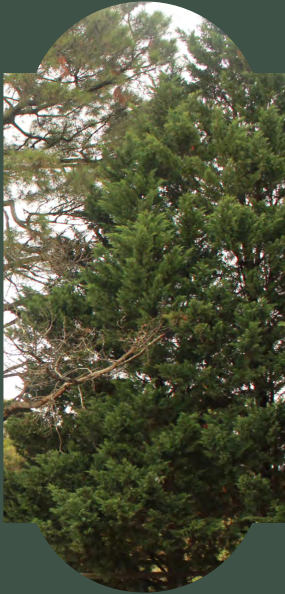
Lot 38 — 64 May Road