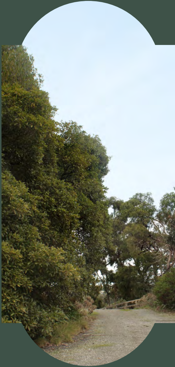
Lot 30 — 64 May Road