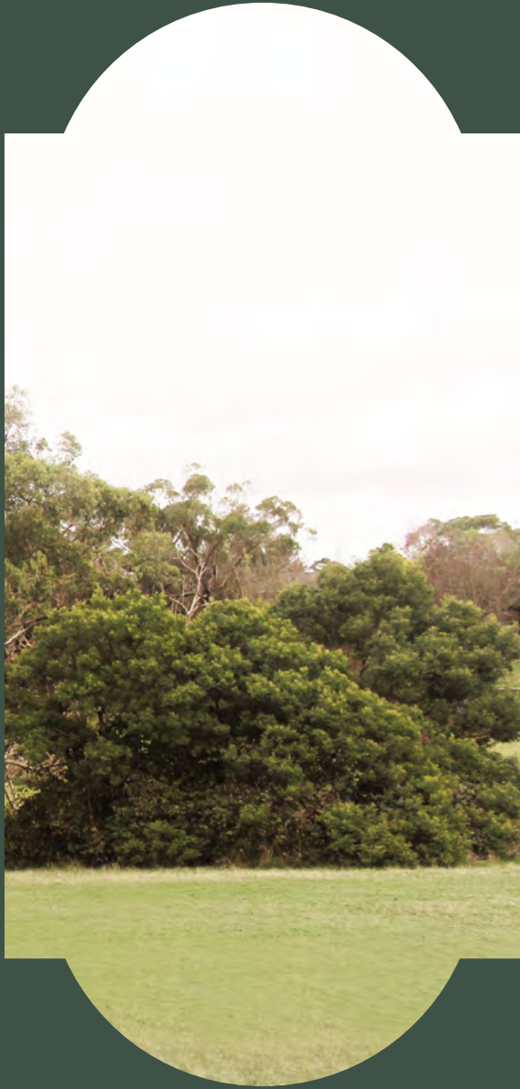
Lot 43 — 64 May Road