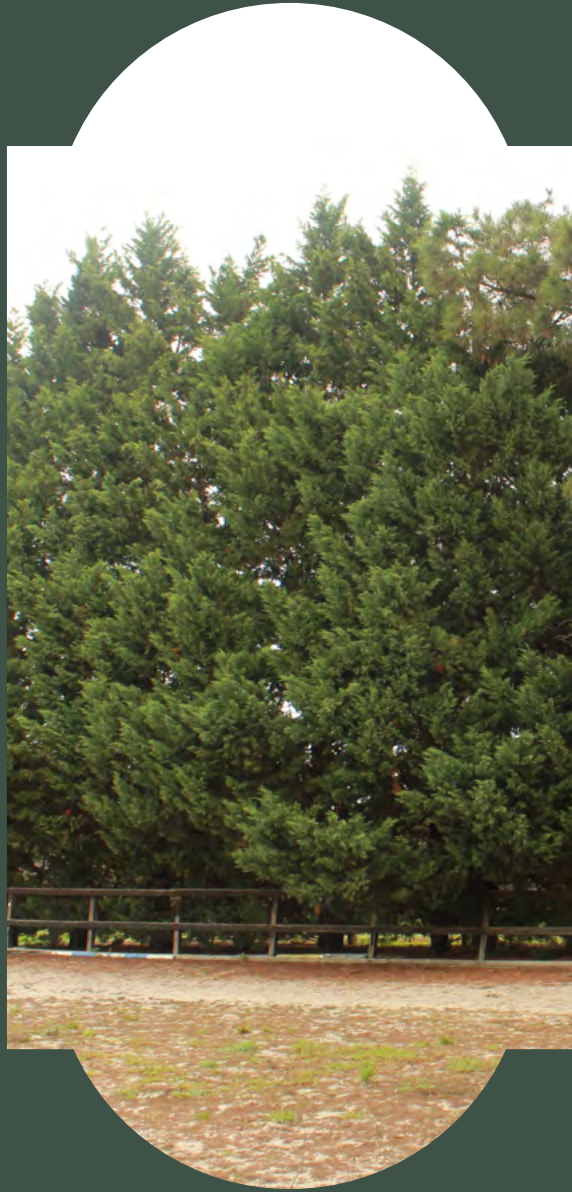
Lot 34 — 64 May Road