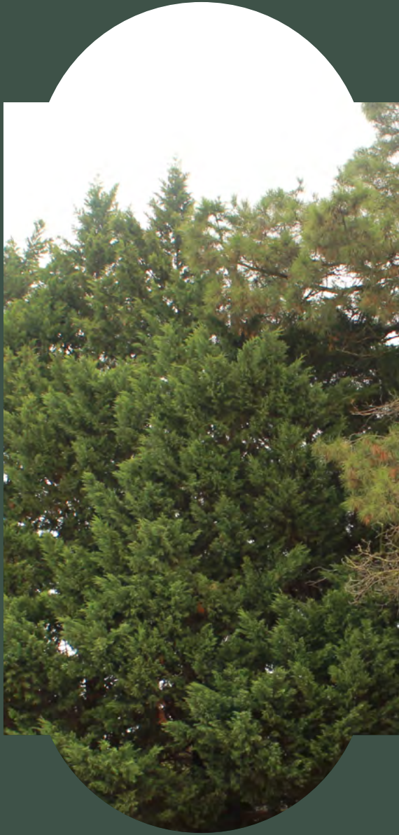
Lot 31 — 64 May Road