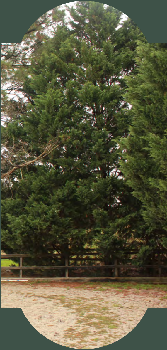
Lot 26 — 64 May Road