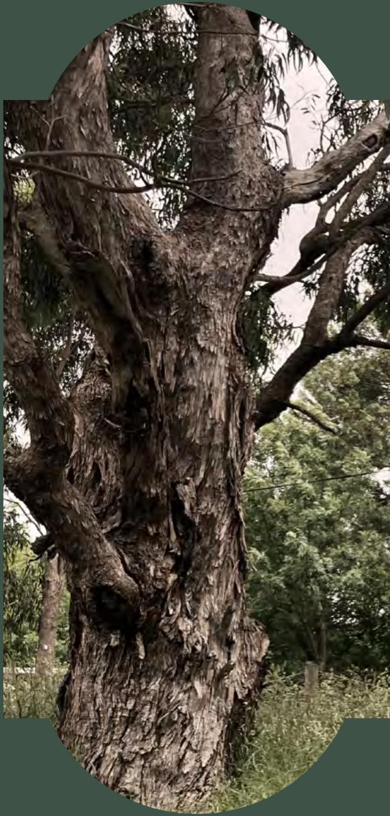
Lot 3 — 64 May Road